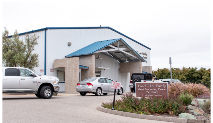
LAU FAMILY MEAT PROCESSING CENTER