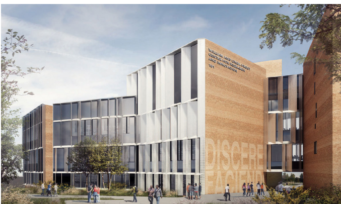
FROST CENTER FOR RESEARCH AND INNOVATION