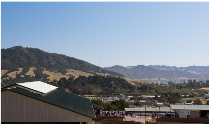
OPPENHEIMER FAMILY EQUINE CENTER