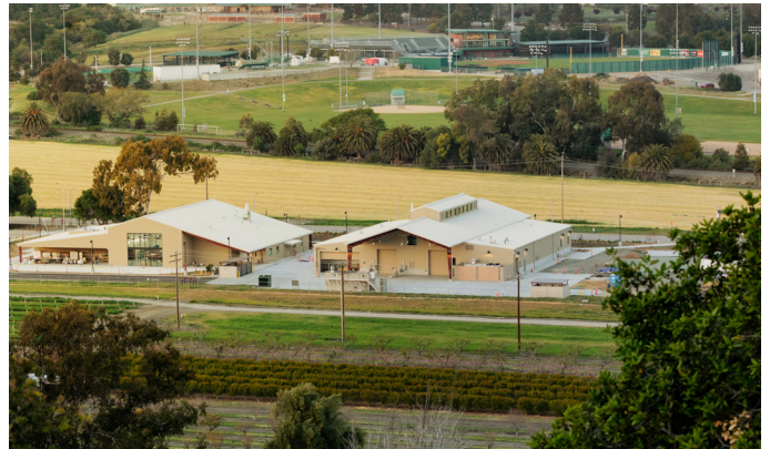
JUSTIN AND J. LOHR CENTER FOR WINE AND VITICULTURE