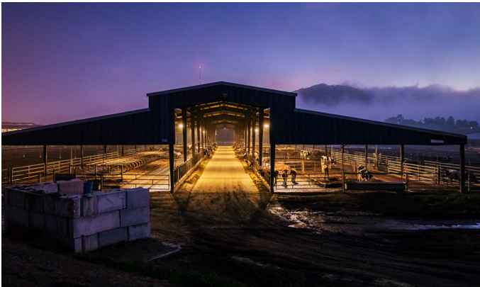
CAL POLY DAIRY